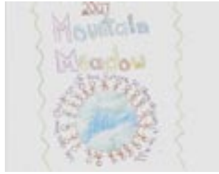
Celisia, age 12 #1