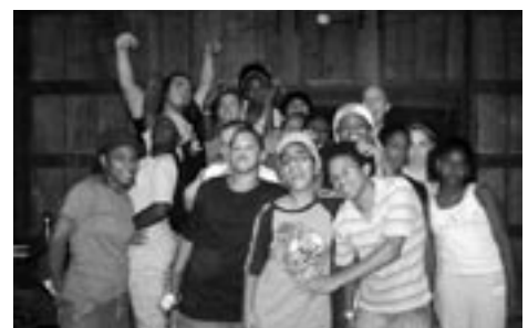
Lorde tent circle

A February snowstorm didn't stop eighteen Mountain Meadow youth and adults from speaking out for the right for youth from LGBTQ families to be visible. The Evesham School Board held an open forum on the evening of February 13th regarding the film "That's a Family," a film designed to promote family diversity. Mountain Meadow's youth and parents spoke from the heart in ways that were heard by both the School Board and the parents who were opposed to the film. Thank you to everyone who braved the weather to make a difference!