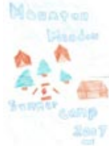
Julia, age 12 #2