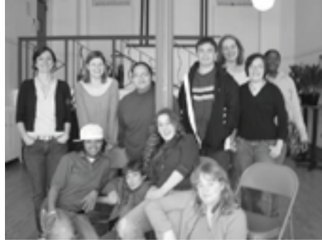
Teen Trip to NYC with COLAGE

This incredible growth has been possible due to increased support from individuals and foundations who are passionate about community, personal development, and social change for youth from LGBTQ families. I hope you will join me in supporting Mountain Meadow's program expansion by making a contribution to the Calamus Foundation match (see below for more information). Your support will make continued growth possible.